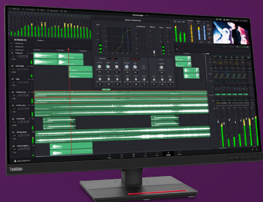
ThinkVision P32p Display