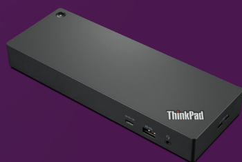
ThinkPad Workstation Thunderbolt™ 4 Dock