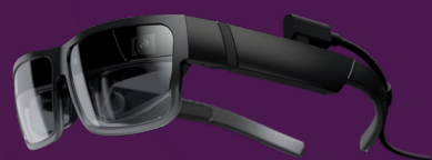
ThinkReality A3 XR1 3G+32G