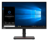
ThinkVision S24e-20 23.8" FHD Monitor