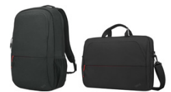
ThinkPad Essential Backpack and Topload (Eco)