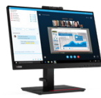
ThinkVision T22v-20 21.5" FHD Monitor with integrated webcam, microphone, and speakers