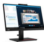
ThinkVision T22v-20 21.5" FHD Monitor with integrated webcam, microphone, and speakers