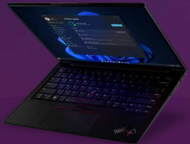
ThinkPad X1 Carbon

Zero-touch device deployment and policy management to updates, secure single sign on, and secure remote help.