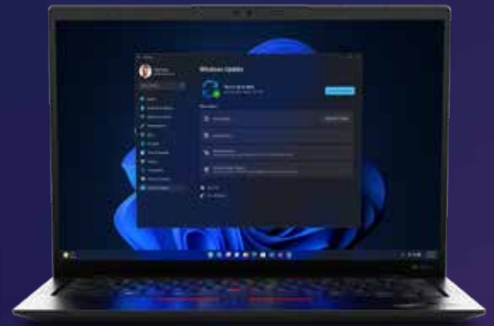
ThinkPad X1 Carbon

Welcome your employees back to work powered by Lenovo and Windows 11 Pro